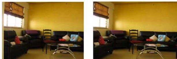
Fig.3: Real time input images from a set of six images