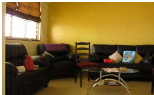
Fig.5: Output of blending six images