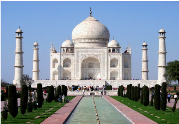
Fig.2 The retrieval has to be robust in contrast of illumination and difference of point of view

The system was designed for databases containing relatively simple images, but even in such cases large differences can occur among images in file size or resolution. In addition, some images may be noisier, the extent and direction of illumination may vary (see Fig. 2), and so the feature vectors cannot be effectively compared. In order to avoid it, a multistep preprocessing mechanism precedes the generation of descriptors.