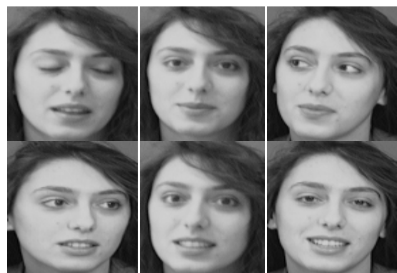
Fig. 3 Different orientations of a particular Subject [9]