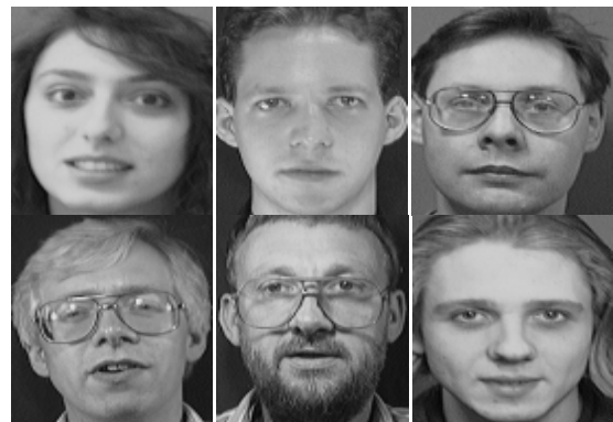
Fig. 2 Subject of AT&T Face database [9]

AT&T Database of Faces [9], (It was also called as 'The ORL Database of Faces'), contain a set of face images taken at AT&T laboratory. This database contains forty distinct individual and for each individual there are ten different images. For some individual, these images were captured at different times, with different light conditions and also for different facial expressions like open/closed eyes, different smiles and with glasses or no glasses. All the images were captured on dark background with the subjects in an upright, frontal position. The files are in PGM format. The each image is of 256 grey levels per pixel [9].