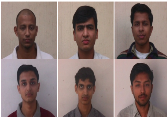
Fig. 6 Subject of Indian Face Database (Males) [10]