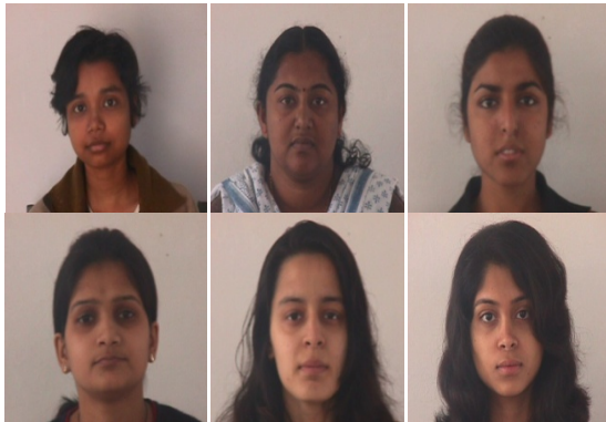
Fig. 4 Subject of Indian Face Database (Females) [10]

captured: front, left, right, up, up towards left, up towards right, down, laughter,neutral, sad/disgust,smile. The files are in JPEG format [10].