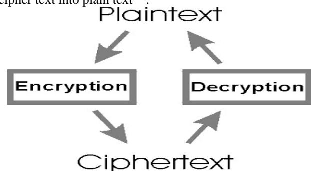
Figure 1: Conversion of plain text to cipher text and vice versa

Decryption: It is the process of decoding the data which has been encrypted into a secret format. An authorized user can only decrypt data because decryption requires a secret key or password. In simple terms it is the conversion of cipher text into plain text [6] .