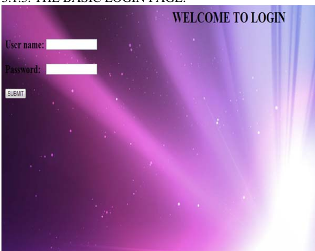
DIG: Basic login page