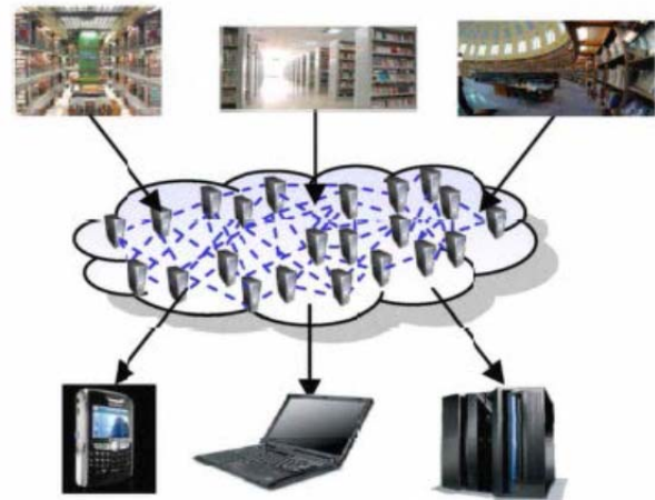
Figure 3 Use of Cloud Computing in University Library

With the rapid development of various IT technologies, users' information requirements are progressively adapted and now more and more libraries sponsored user-centered services. So librarians should mine and study users' information desires frequently and only in this way, they can master the basic demands of their users and furthermore, library can develop itself according to such information and improve users' fulfillment. University library, as we all know, is well-known for its hypothetical and teaching influences. And IT technology has been the driving force of library development. What's more, librarians can keep using new technology to develop library and enhance library services. With the growth of Cloud Computing request, this paper anticipated to apply Cloud Computing in libraries. By establishing a public cloud among many university libraries, it not only can conserve library resources but also can improve its user satisfaction, and it can be illustrated in figure 3.