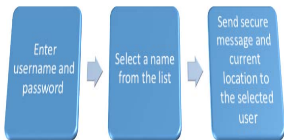
Fig 2 : Steps done by the Sender

SecuredSMS protocol is free from various attacks such as Replay attack, Man-in-the-Middle attack, SMS Disclosure and Impersonation attack. AES encryption is used here. Due to the high security offered by this protocol, it is used to design the application ‘Secret SMS’. Military organizations mainly focus on the confidentiality, integrity and also on timely delivery of messages to the intended recipients. This application provides this and hence it offers another option to the already existing communication options.