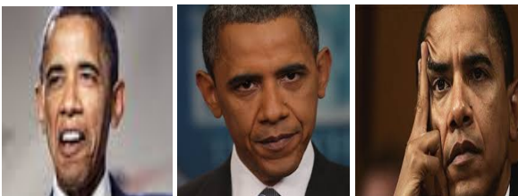
Figure 1.1: Facial Expressions of Barack Obama

For illustration, we show some examples of facial expressions in Figure 1.1.