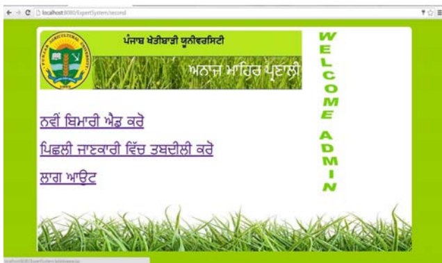
Fig. 4 Home page for administrator