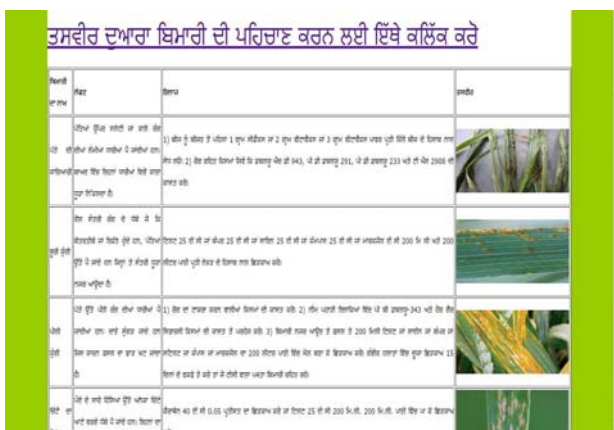
Fig. 5 Web page showing symptoms, precautions and images of various leaf disease of wheat

When a farmer login into the system and select his required crop then symptoms, precautions and images of all the leaf disease of that crop are displayed as shown in fig. 5. If the farmer however is unable to understand the displayed information he can upload the image of his infected leaf. The system will compare the uploaded image with the images in database and will give the farmer appropriate results.