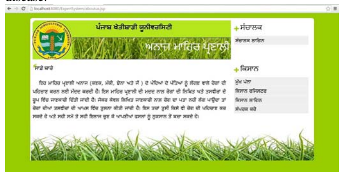
Fig. 3 Home page of web based expert system

The administrator can add and update the information in Punjabi language by using a Punjabi keyboard. The registered users can view the diagnosis information for the leaf disease of a cereal. They can also upload the image of infected leaf and system will compare the uploaded image with images in database to detect the disease.